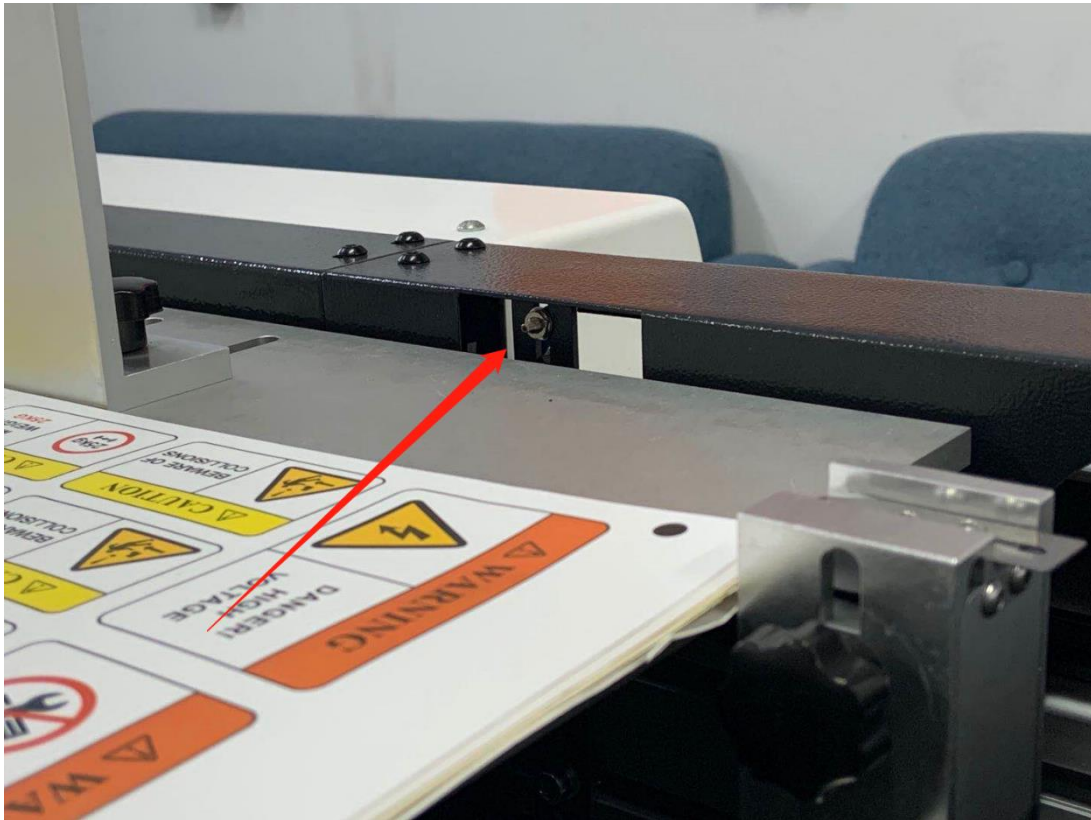
Sensor on the right side