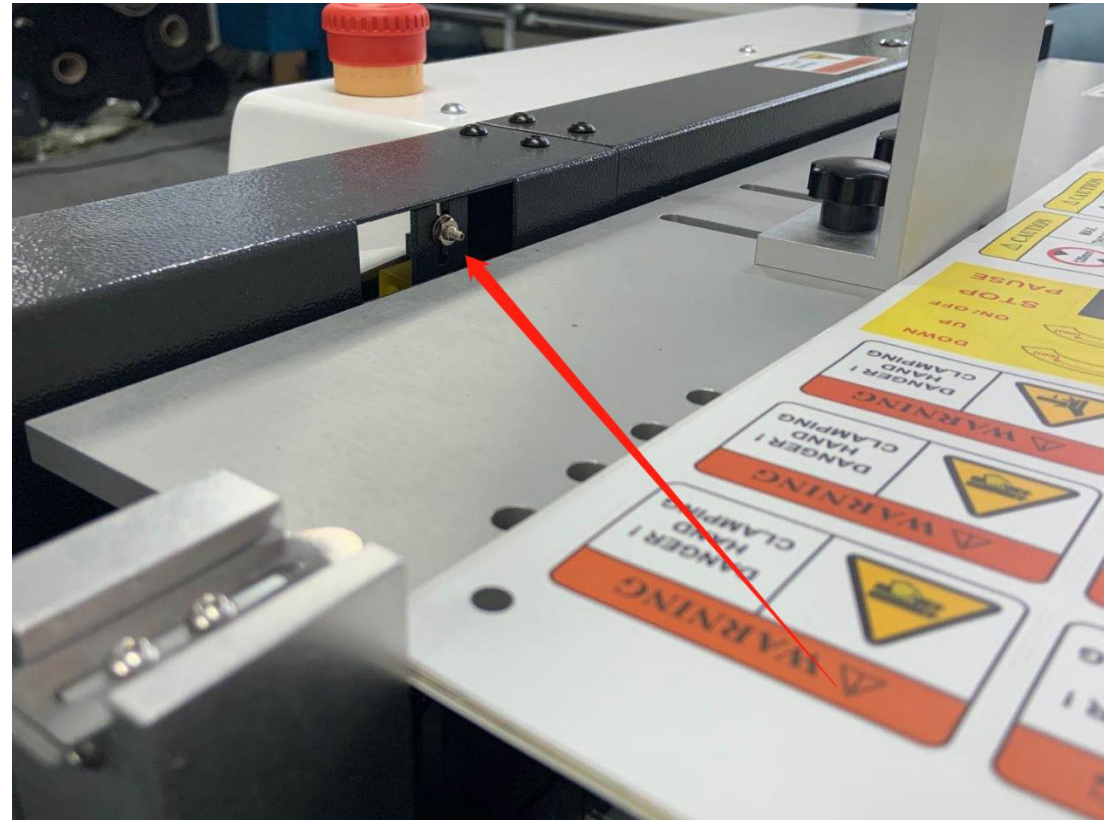
Sensor on the left side