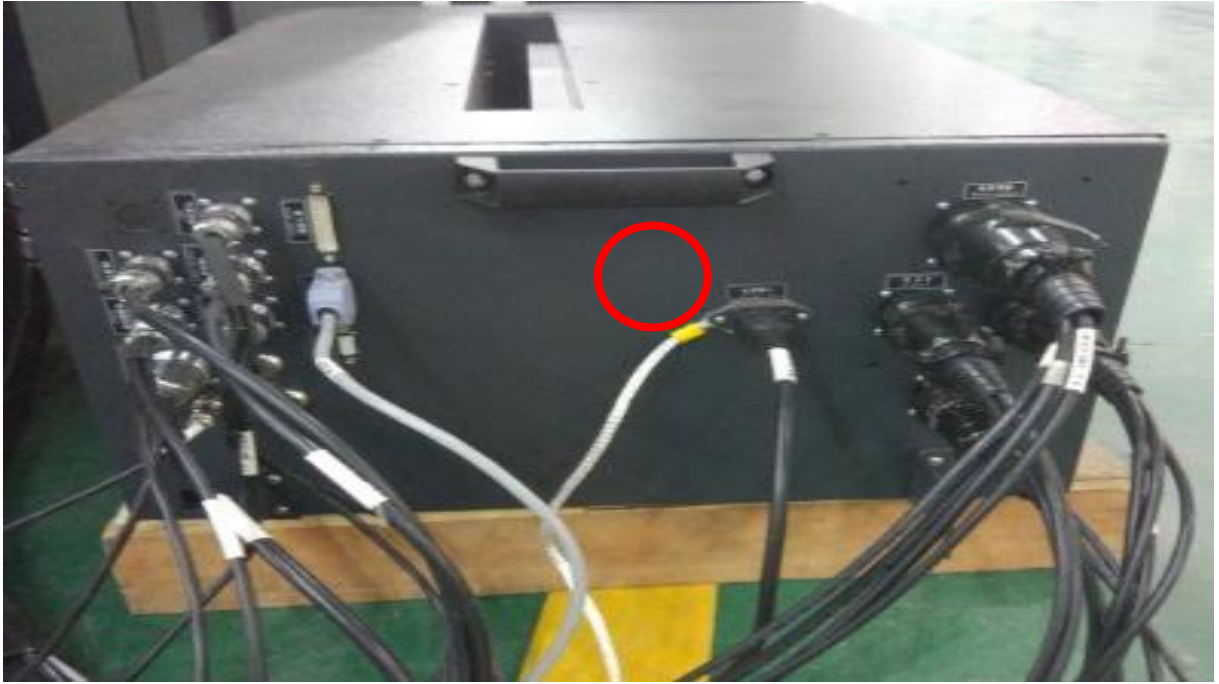
2. Computer cable and communication cable.